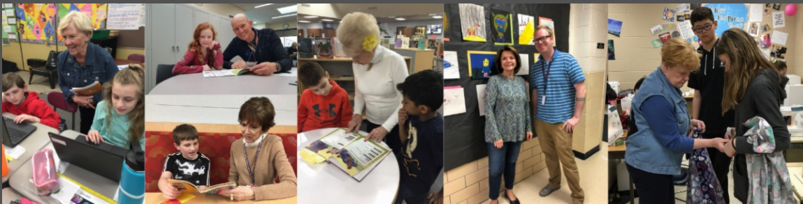
HURRAH program volunteers at work.

For more information, visit the HURRAH Program webpage , or call the District 203 Community Relations Department at (630) 420-6475.